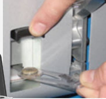
Figure 2: A four module portable analyzer