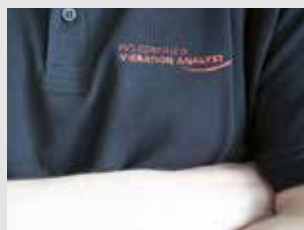
Service & Support

Laser measurement systems and services for optimum machine and asset alignment.